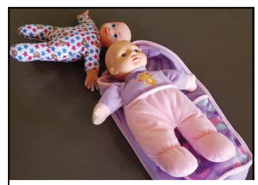
Cute little dolls for Cradle Quilts

If you would like a kit or batting to make your own quilts, call Noeleen. Please use colors that little girls between the ages to 2 to 8 would like. The size should be at least 18 inches and no bigger than 20 inches square.